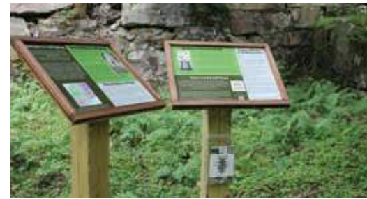
Informational panels about the Cold Spring site history.

Partnerships and collaboration reinforce the social fabric in our community, and we appreciate opportunities in 2023 to participate. We honored the original inhabitants of this region, the Stockbridge-Munsee Band of Mohicans, through the installation of informational panels at our Cold Spring site and hosting a luncheon organized by Williams College students on Indigenous Peoples' Day. We partnered with the international Tupelo Press on an arts and literature review journal, Northern Berkshire Landscapes: A Celebration , with additional collaboration from the Clark Institute of Art and Northern Berkshire Community Coalition.