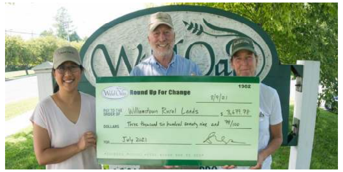
Board members with Wild Oats "Round up for Change" check

Last year, we decided to try an online auction for the first time in place of our usual in-person silent auction paired with a local foods dinner. Our board, staff, many of our members and local businesses generously contributed unique experiences, services, special dinners, art, vacation stays and more. It all made for a tempting array of offerings. Unhindered by the discomfort of bidding against a friend, which sometimes occurs at our silent auctions, lively and unfettered bidding abounded. The auction was a resounding success, and our thanks go out to the many who played in the bidding as well as the donors.